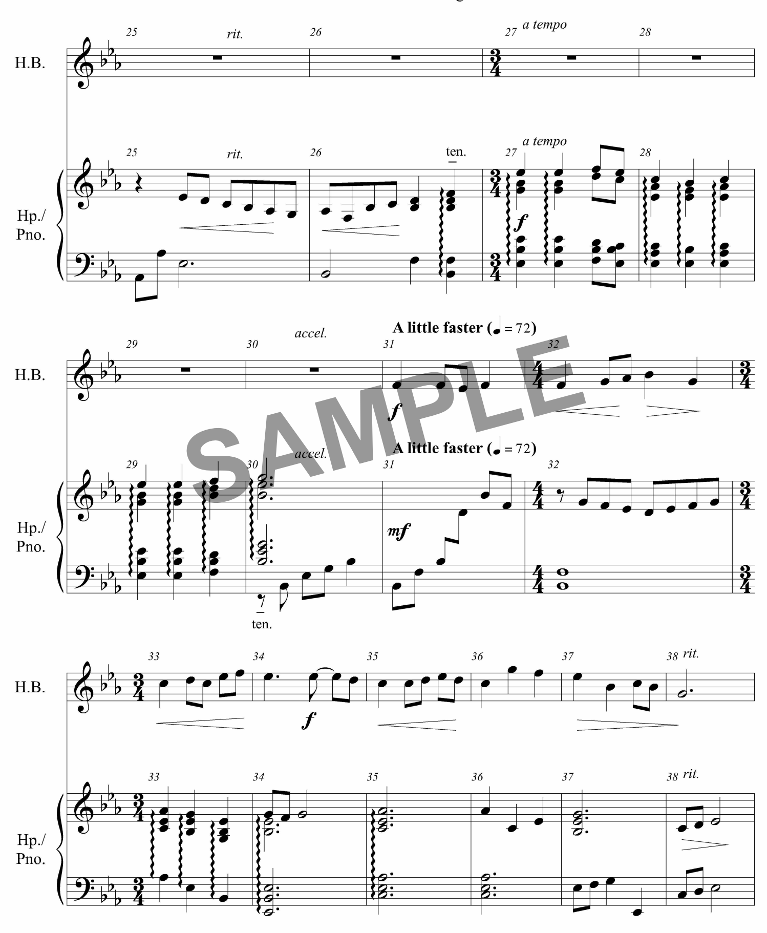
Slane - Full Score - Page 2 of 3

©2009 Holsinger Music (ASCAP) & TheGoldenDance.com (ASCAP) License agreement: http://www.TheGoldenDance.com/publishing.htm TGD1025-FS